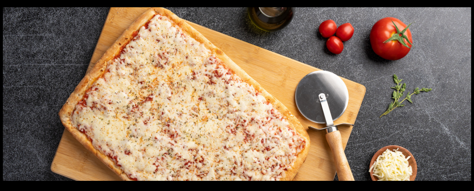
Family Size Oven Ready Sicilian and Thin & Crispy Pizza